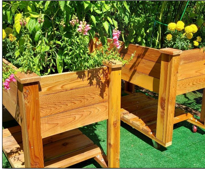
Shelves, wheels & many additions are possible - please inquire. (Example Pictured Above)